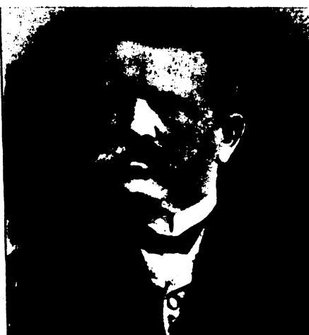
Alois Hitler -- Hitler's father. Note resemblance to Hindenburg.