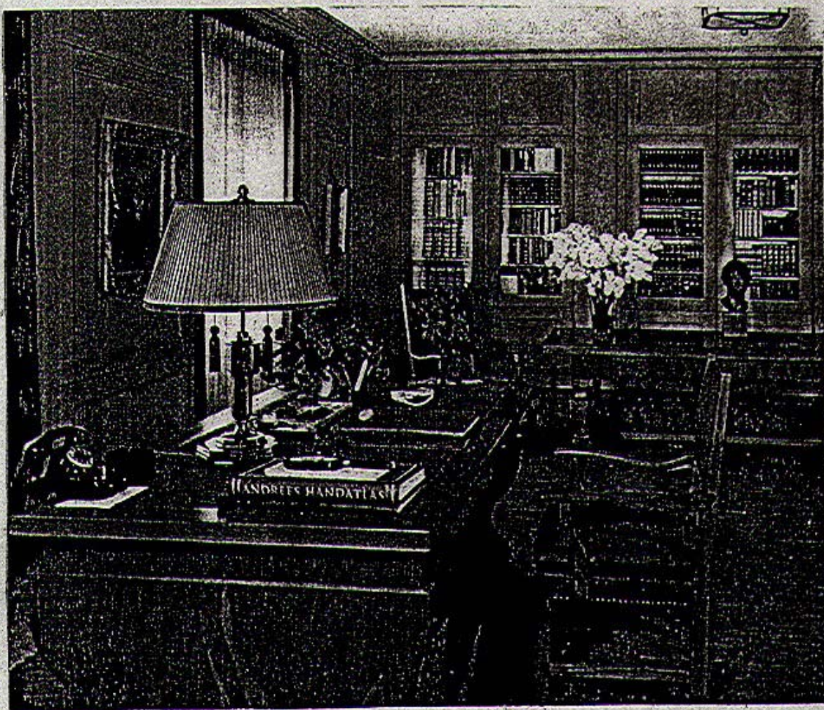
Hitler's Study at Berghof. Desk faces portrait of Alois Hitler.

(j) Adolf Hitler has hung a portrait of his father over the desk in his study at Berchtesgaden. This is a signal honor, since the likeness of only three other men -- Frederick the Great, Karl von Moltke, and Mussolini -- have been selected for inclusion in any of Hitler's rooms. There is nowhere any picture of his mother.