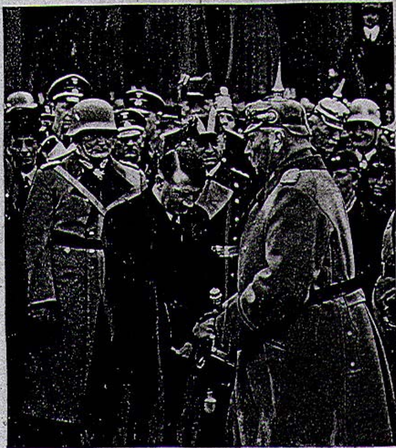
Hitler and President Hindenburg on the Day of Potsdam March, 1933

(11) Strasser: Hitler's attitude towards the General was obsequious; he was in agreement with everything Ludendorff said.