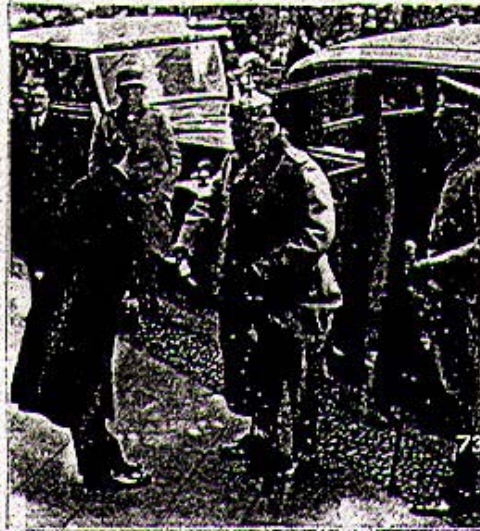
Note the subservience of Hitler's bow.

(iii) Heiden: In the midst of the Munich Putsch Hitler exclaimed to Kahr in a hoarse voice: "Excellency, I will stand behind you as faithfully as a dog!"