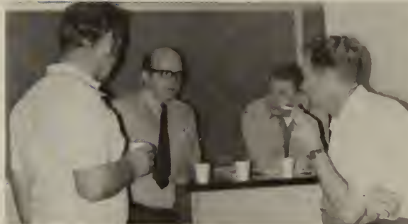
Three of our Farm Supply Centre Managers all alone with their Supervisory Management Training Program —